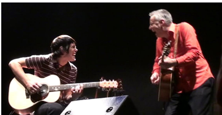
With Tommy Emmanuel